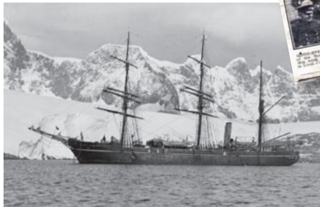
RRS Discovery 1901-2 (Photographer unknown, British Antarctic Survey).