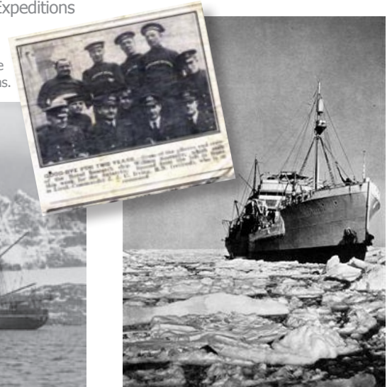
RRS Discovery II in the pack ice (South Latitude), the third and last ship used during the Discovery Expeditions.

Southern Ocean scientists have identified the need for biological datasets spanning the longest possible temporal and spatial range, in order to fully understand the ecological processes affecting the Southern Ocean ecosystem. Data collected during these early expeditions were carefully recorded at the time, but in formats (sometimes handwritten notebooks) that are no longer viable for long-term access. Data from more recent expeditions had lost their value by becoming separated from the metadata needed to understand them fully or had been collected aboard several collaborating ships over a number of years and considered in addressing specific scientific questions but had not been brought together as one data resource.