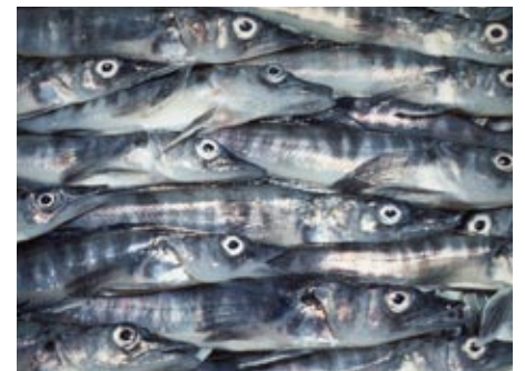
Mackerel Icefish Champsocephalus gunnari . (Photograph: Inigo Everson, British Antarctic Survey).

Southern Ocean scientists have identified the need for biological datasets spanning the longest possible temporal and spatial range, in order to fully understand the ecological processes affecting the Southern Ocean ecosystem. Data collected during these early expeditions were carefully recorded at the time, but in formats (sometimes handwritten notebooks) that are no longer viable for long-term access. Data from more recent expeditions had lost their value by becoming separated from the metadata needed to understand them fully or had been collected aboard several collaborating ships over a number of years and considered in addressing specific scientific questions but had not been brought together as one data resource.